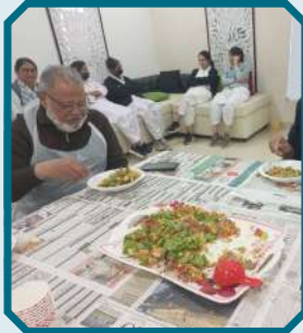
Now it's time to taste our culinary creations