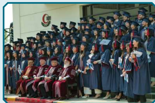
Group Photo with Dignitaries

The ceremony was followed by high tea for graduates, their parents and esteemed guests.