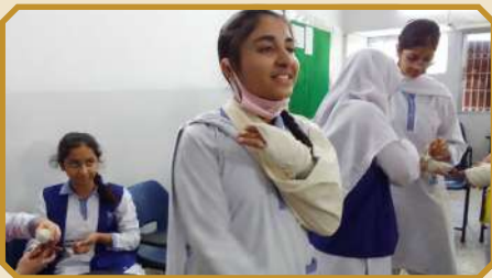
Jaffar Public School, Emergency Response Skills Bandage Practice with Participants

A series of (10) sessions were conducted with the students of Jaffar Public School, where approx. 20 participants were trained, from February-March 2023. Participants were oriented in dealing domestic emergencies including managements of Bleeding, Wounds, Fracture, Burns, Heatstroke, Drowning, Fits, Fainting, managements of a person