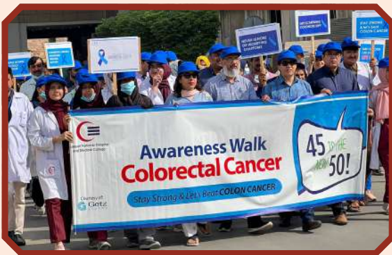
Colorectal Cancer Awareness Day

Colorectal Carcinoma is a deadly cancer which is preventable through screening colonoscopy. The purpose of this walk is to make people aware of the colorectal carcinoma screening program. Department of Gastroenterology Liaquat National Hospital arranged a walk on National Colorectal Cancer Awareness Program in March 2023. Our consultants, post graduate trainees, students and hospital staff participated in the walk wearing blue color on blue day (Colorectal Awareness Day). The walk was organized for public awareness of the colorectal screening program. Lets prevent it and diagnose it as early as possible.