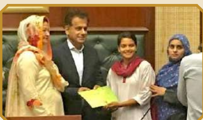
Meeting the Commissioner Karachi after return from the tournament in 2017