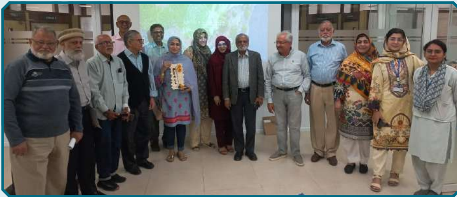
Celebrating the Diversity of Thoughts and Shared Experiences

At the Senior Citizens Primary Care Facility, we recognize the invaluable importance of providing encouragement and support to our beloved senior members. Aging is a unique journey, and we believe that seniors deserve opportunities to stay motivated, inspired, and connected. That's why we recently organized a series of motivational speaker events specifically tailored to our senior community.