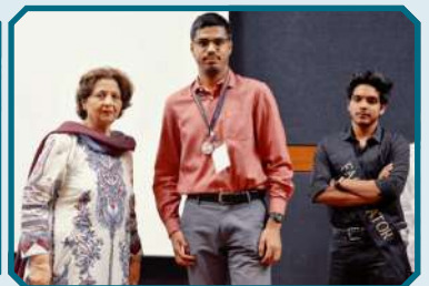
Principal LNSMT presenting medal to winner