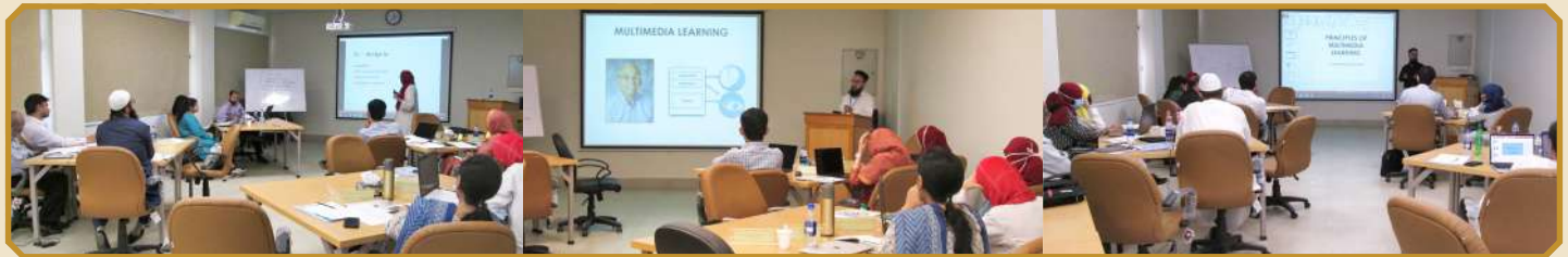
Face-to-face session of Certificate in Health Professions Education (CHPE) Batch 4

interest in medical education. DHPE and affiliated faculty from the Liaquat National Hospital and Medical College shall continue to devotedly provide future training and help to the Medical and Dental Sciences teaching staff as the interest of medical educators towards health profession education grows.