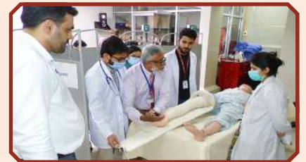
Team Course for LNHMC Final Year Students Demonstration of Placement of Thomas Splint Traction