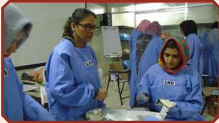
Gloving and Gowning Session with Gynae Resident

Basic Surgical Skills were conducted on 6 th February 2023 for Obstetrics and Gynecology Department Newly Inducted Residents. Gowning, Gloving, Scrubbing, Foley's Catheter and Knot Tying". The objective of the workshop is to nurture and develop skills on clinical practices.