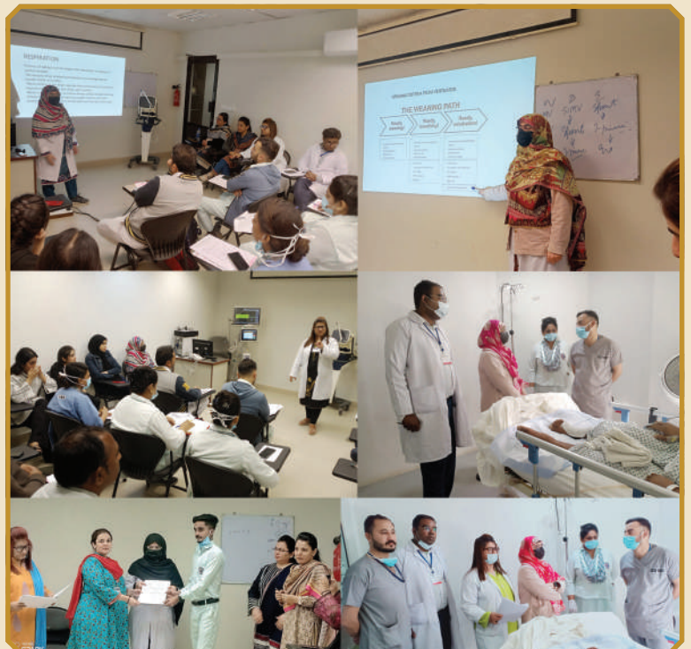
Team of Expert have conducted a comprehensive session and hands-on practice on a real time situation to execute the concepts of Mechanical Ventilation

The team of experienced instructors uses the latest teaching methodologies to enrich each participant's learning experience and abilities to deliver optimal mechanical ventilation in a clinical setting. The aim of this Quality Initiative Project was to enhance the confidence and knowledge of bedside nurses in managing the patient on mechanical ventilator efficiently in critical care setting. In Section 04, K-Block, this learning with hands-on practice course was organized for over a period of 4 days in January 2023 in which we have trained 13 Nurses in phase 1 with an emphasis on hands-on practice along with the knowledge integration and handling troubleshooting.