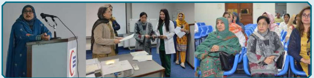
Workshop on Prevention of Cervical Carcinoma