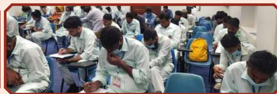
Examination in process

Nursing-AART is a comprehensive certification program that integrates resuscitation training, performance improvement, critical procedures, and in-hospital patient safety initiatives. Nursing-AART empowers health care providers of all disciplines by creating a “culture of resuscitation” that enhances patient safety.