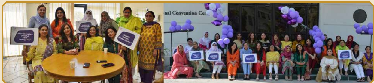
International Women's Day Celebration

On March 8, 2023, the female staff of Liaquat National Hospital celebrated International Women's Day with solidarity and promoted women empowerment. All female heads of departments gathered at the convention centre and enjoyed each other's company while discussing the importance of an independent woman. Furthermore, they utilized this day to acknowledge the achievements of women within their respective departments. The day ended with a group photo of all the leading women of Liaquat National Hospital.