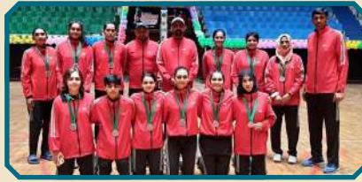
Team after prize distribution ceremony

I am currently an active player for the Pakistan Army, continuing my passion for sports and basketball in particular.