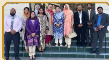
Jury Members and Organizers