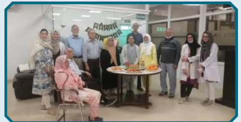
"The members and staff are enjoying the birthday party that was planned for our member, and the atmosphere was joyful and celebratory."