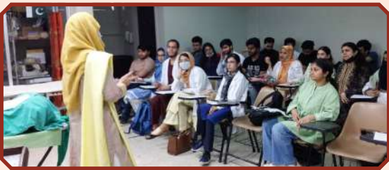
LNHMC Students Pap Smear Session

Hands on session on Pap smear was conducted for the students of reproductive module-II. A pap smear is also known as Test or Pap test. It involves exfoliating cells from the transformation zone of the cervix to enable examination of these cells microscopically for detection of cancerous or precancerous lesions.