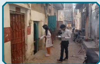
Community Field by WHO