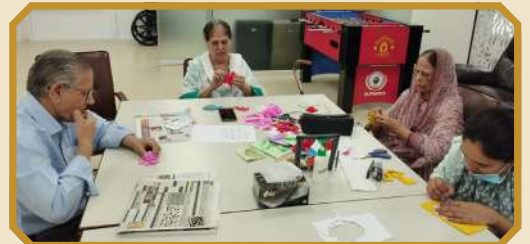
Keeping their brains stimulated and actively engaging their minds helps increase the overall wellbeing of our senior members.

Art and craft activities can provide older adults who are not working but still living independently with a fresh sense of purpose and mastery, important benefits of art and craft activities is that they keep seniors' mind engaged.