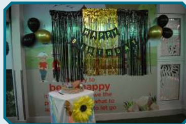
Experience the joy of a Birthday Bash celebration with our vibrant and captivating décor, specially designed to make our senior citizens feel celebrated and loved.