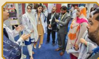
Jury Members questioning the poster presenters during the event