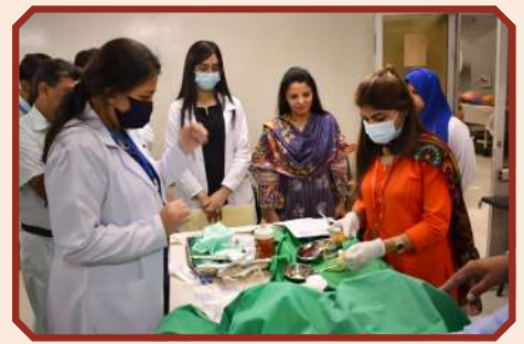
Participants at hands on station of catheterisation

Participants learned both the theoretical and practical aspects and had a well-rounded learning experience. The hallmark of the course included hands-on training using advanced surgical equipment and