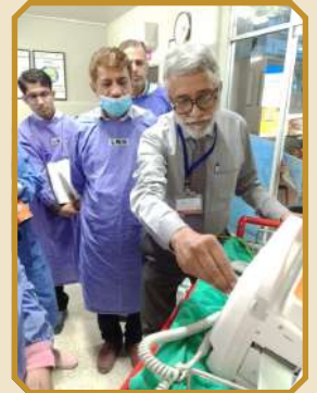
Mega Code Run