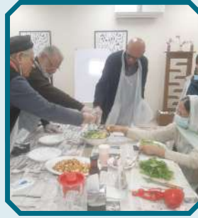
After working hard together, they celebrate and enjoy a delicious meal.