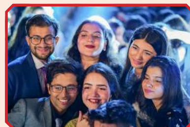
Students enjoying the program