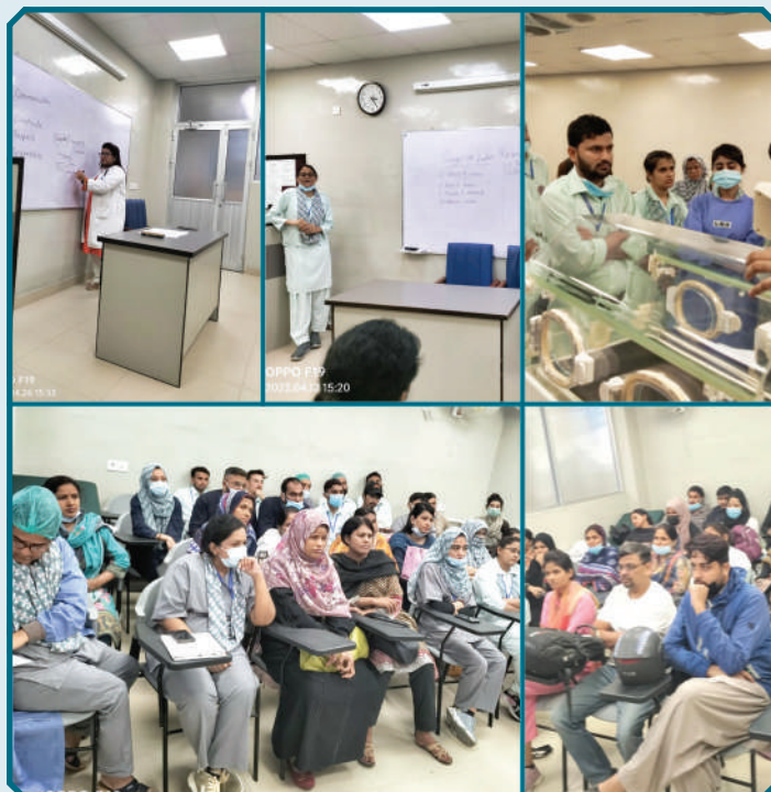
Classroom and hands-on session for all the nursing staffs for their continuous learning for excellence

This planner includes a broad range of learning opportunities such as short session, hands-on practice on equipment on-site training for patient hands-off. The aim of this initiative is to equip individuals with the knowledge, skills, and abilities to excel in their profession while driving personal and organizational growth. In the month of April 2023, we conducted 15 sessions on daily basis. In this session, 80% of nursing staffs from section 01 have been covered. This practice will foster a culture of continuous learning to provide opportunities for individuals to enhance their knowledge, skills, and abilities with hands-on practice.