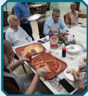
"Our talented members are working hard to create delicious, mouth-watering dishes for enjoyment.

It is a crucial component of fitness, but as we become older, we tend to overlook these abilities, cooking can help to practice mindful skills. A skill that might assist our health and each bite is experimenting with different meals in a balanced way.