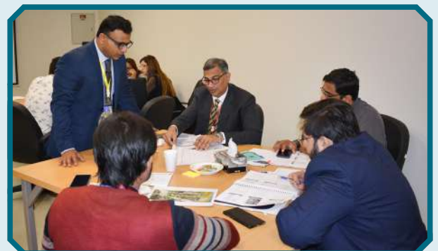
Hands on Exercise

Commission (SHCC), Environmental Management and Occupational Health and Safety Management standards, the workshop was based on discussions and hands-on exercises to maximize participants’ understanding on the subject. The