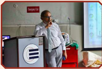
Course facilitator delivering lecture

urinary catheter, gastrostomy, chest tube, IV line and bowel and urinary stoma.