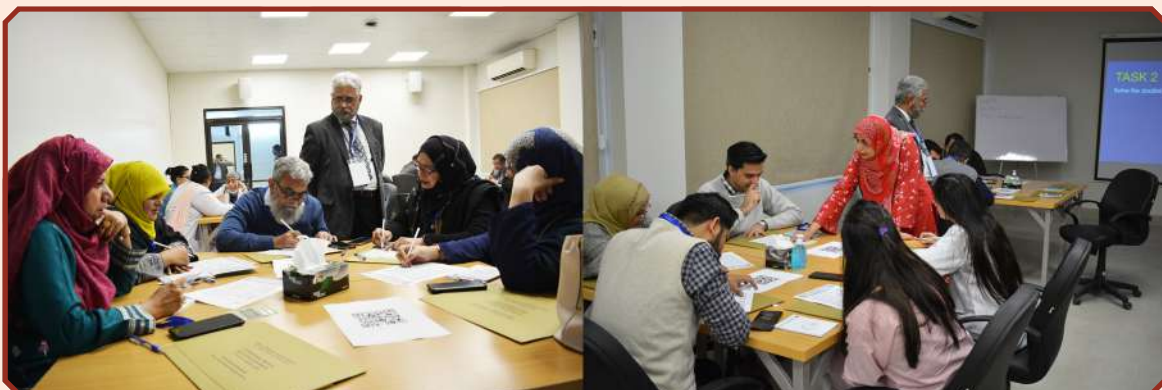
Teaching in Clinical Environment: when there is no time to teach