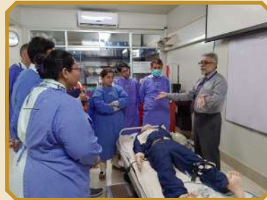
Mega Code Practice