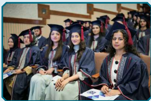
Graduates Sitting in the Auditorium

He also emphasized that getting the degree is not the end; it's the beginning of a doctor's career. In the practical life, a doctor should listen to the voices around him, not of those who have wealth or power, but the voices of the poor and needy. He defined success as not only acquiring wealth, fame or power, but the pathway to help the needy and to serve the community selflessly.