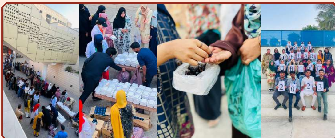
BSMT Students Distributing Iftar in LNH

Cherishing the true spirit of the Holy month of Ramadan, the students of Liaquat National School of Medical Technology organized and conducted a week long philanthropy drive "Blissful Iftar 2023". During this self funded event, daily more than 200 Iftar boxes and water bottles were distributed among the attendants of patients and others within the premises of LNH. We are grateful to everyone who supported this effort and pledge our continuous support to students in organizing such events in future.