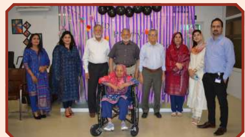
Let us celebrate together and spread love and kindness as we commemorate this special day.