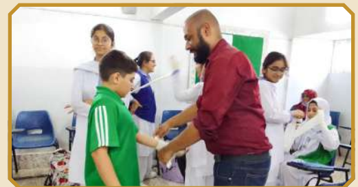
Jaffar Public School, Bandage Practice with Students

A series of (10) sessions were conducted with the students of Jaffar Public School, where approx. 20 participants were trained, from February-March 2023. Participants were oriented in dealing domestic emergencies including managements of Bleeding, Wounds, Fracture, Burns, Heatstroke, Drowning, Fits, Fainting, managements of a person