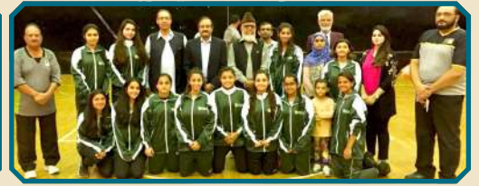
Back when I represented Sindh/Karachi in womens national basketball championship 2017