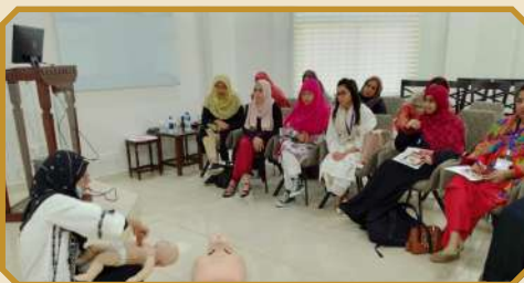
Pakistan Navy Finishing School, Demonstration of Emergency Skills on Infant and Management for PNFS Staff

The Family & Friends CPR Course teaches the lifesaving skills of adult Hands-Only CPR, adult CPR with breaths, child CPR with breaths, adult and child Automated External Defibrillator (AED) use, infant CPR, and mild and severe airway block for adults, children, and infants.