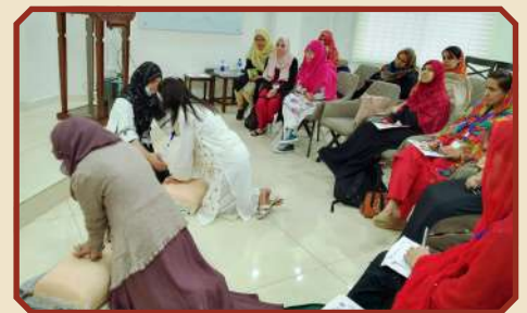
Pakistan Navy Finishing School, Demonstration of Emergency Skills on Hands Only CPR

The Family & Friends CPR Course teaches the lifesaving skills of adult Hands-Only CPR, adult CPR with breaths, child CPR with breaths, adult and child Automated External Defibrillator (AED) use, infant CPR, and mild and severe airway block for adults, children, and infants.