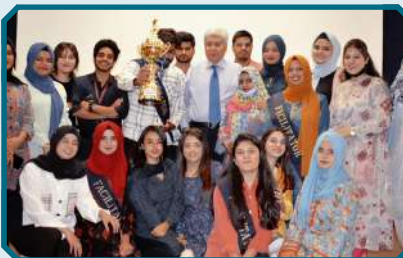
Medical Director LNH&MC presenting trophy to winning team