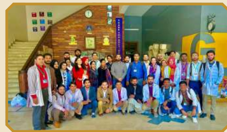
School Project at NJV