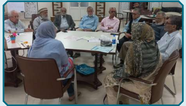
Everyone Engaged and Shared their Authentic Thoughts

Whether it's through sharing their love with their families or through engaging with their friends and peers at these events, seniors can continue to make a difference in their communities and in the lives of those around them. So let us celebrate and empower our seniors, for their wisdom is a source of inspiration for us all."