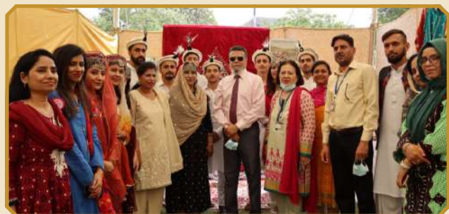
Controller-Nursing Administration, Principal-College of Nursing, faculty, staff, and students at the Culture Diversity Day

On 20 th March, 2023, the students of Liaquat National College of Nursing celebrated the Culture Diversity Day at LNCON. The students of B.S. Nursing (Generic) 3 rd Year Semesters 5 and 6 were the chief organizers and collaborated with other students of LNCON to set up stalls representing the five provinces. Each stall displayed cultural items such as clothes, jewellery, musical instruments etc. of that province and traditional food items. Students performed a tableau depicting the famous folk tale of Heer Ranjha. Another group of students enacted a traditional Sindhi wedding ceremony. Students of all provinces performed traditional folk dances to local music. Students and faculty of College of Nursing and other institutes of Liaquat National Hospital attended the event enthusiastically.