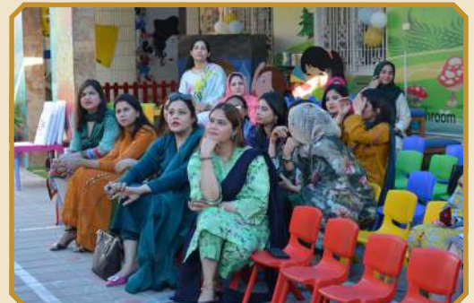
Awareness session on Health & Fitness in Mothers at Beacon House School, Gulshan-e-Iqbal