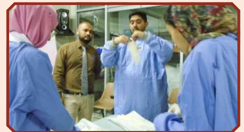
Gloving & Gowning Session with Gynae Residents

Basic Surgical Skills were conducted on 6 th February 2023 for Obstetrics and Gynecology Department Newly Inducted Residents. Gowning, Gloving, Scrubbing, Foley's Catheter and Knot Tying". The objective of the workshop is to nurture and develop skills on clinical practices.