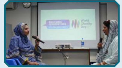
Role Play Activity by the Participants