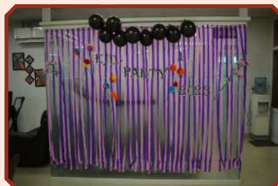
Let's cherish the moments of togetherness and spread love and kindness on this special day of Eid