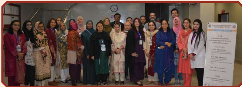
Interactive Journal Club: A Renewed Approach towards Engaging Participants

centers in the country. A few workshops were also conducted at Liaquat National Hospital.