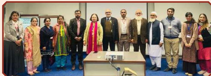
Awareness Session of HIV, Hepatitis and TB