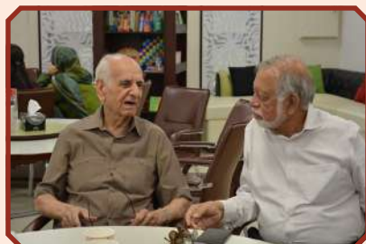
Senior citizens exchange thoughts in their favorite environment.

Senior Citizens Primary Care Unit is also a ritual. EID celebration was held on April 29, 2023. The event included a range of enjoyable activities with variety of feast. Our senior members were dressed elegantly, and the venue was beautifully decorated to create a festive atmosphere. Witnessing the joy and enthusiasm on the faces of our senior clients brought new life and value to their experience.