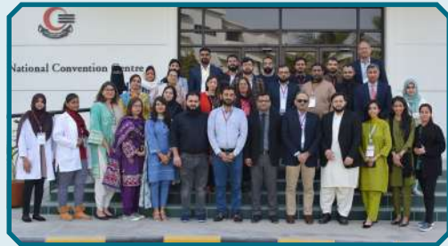
Participations from renowned organizations

participants included people from Top management, doctors, engineers, senior managers, managers from renowned hospitals