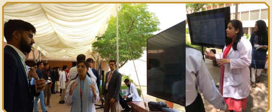
student presenting research poster at AKUH main campus Karachi