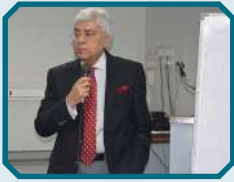
concluding remarks by the Medical Director

Department of General Surgery and Nursing Services organized Nursing Awareness Session on Bariatric Surgery on 28 th February, 2023. Overall 71 participants have attended this session.